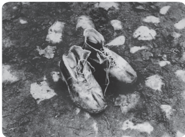
A pair of shoes left behind after a deportation action in the Kovno ghetto. Circa 1943 Lithuania.

They love going to the cinema and in the year before