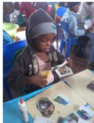
The MRCH Early Childhood Development Centre